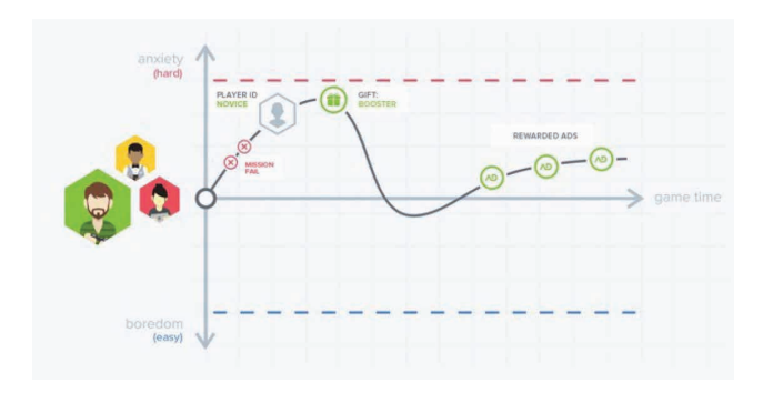
Figure 2: Boosting the skill level of novice players who are struggling with the level of difficulty keeps them in the game.

The first advantage of treating player segments differently is that players enjoy the game more. A player whose experience is tailored to what he or she enjoys — whether it's fast game play, building up coins, tricky puzzles, or plenty of hints — will keep playing and is more likely to be monetized. While it's not possible for every game to appeal to every audience, a fixed difficulty curve excludes a huge group of players who could potentially enjoy a game but are either just a little too experienced or inexperienced for it. For example, customers might find a group of players who are novices and are struggling to move though the levels. They can be targeted with advice or bonuses, while other players find the game easy and need the difficulty levels ramped-up.